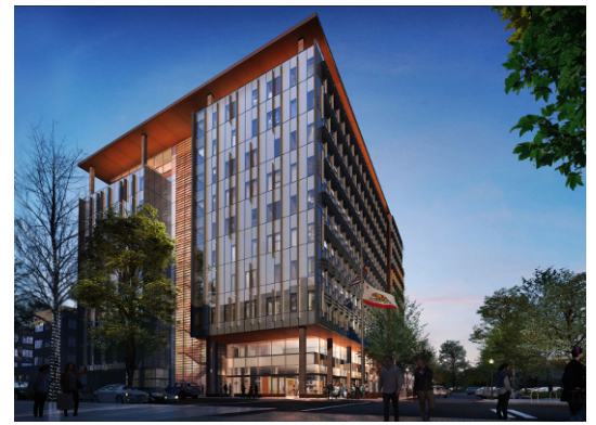
Department of General Services O St. Office Building, Sacramento

Over the past 10 years, Rudolph and Sletten has consistently ranked among the top contractors in California by Engineering News Record. Between new building and construction technology, better earth-friendly materials, and techniques, all the phenomenal employees and the amazing clients and stakeholders, Rudolph and Sletten is looking forward to another great decade.