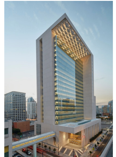
San Diego County Central Courthouse